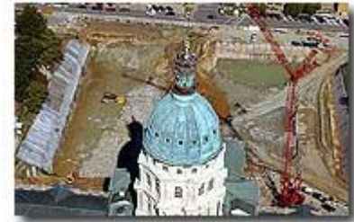
The north side of the Kansas Statehouse grounds, pictured in October, remains under construction.